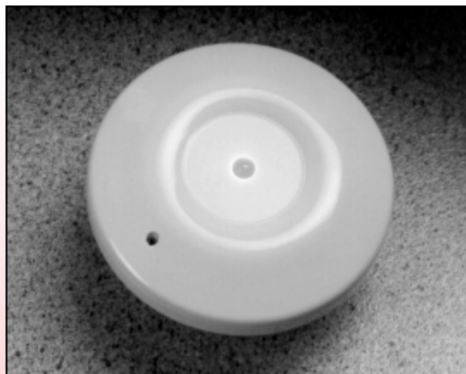
Part no: 53832-070